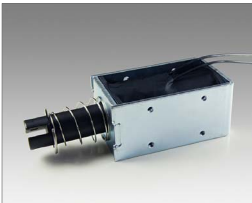
Total weight 总重量 : 363g Plunger weight 滑杆重量: 45g